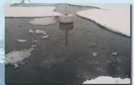
Figure 5. AITP launched from the Chinese icebreaker Xuelong in August 2008 in open water (hole through an ice floe).

The ULS float signal at 1560hz is only transmitted from time to time (once per day) in order to figure out where the ULS floats might be for safety reasons. The ULS floats are programmed for surfacing and transmitting data to satellites in case open water would be detected by the ULS floats. But in the Alpha Ridge region, open water is rather scarce and this opportunity did not occurred up to now. During the Xuelong cruise, we could not get close by the ULS floats and consequently could not download the data stored inside the floats. These data concern sea-ice thickness, absolute pressure and TOAs from AITP signals (780hz) transmitted every four hours in order to locate ULS floats afterwards. Consequently we are planning to land on sea-ice next spring (one year after deployment) in the vicinity of the two ULS floats if we are still in contact with them like we are now, six months after deployment.