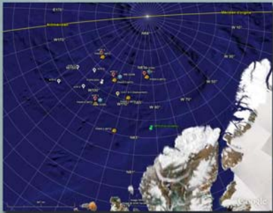
Figure 1. Deployment of the first cluster of 4 AITP (red) + 7 Met buoys (orange) + 3 IMBs (blue) + 2 ULS floats (yellow) in April 2008. Deployment of the second cluster of 4 AITP (white) + one IMB (blue) in August 2008.

by Jean-Claude Gascard (1), Matthieu Weber (1), Antonio Lourenco (1) and Gwenael Calvarin (2) (1) Université Pierre et Marie Curie (2) Kannad