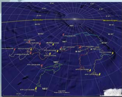
Figure 2. Drifts of the two AITP clusters deployed in April 2008 and August 2008 respectively until October 27, 2008. Red pins represent starting points and yellow pins ending points of the drifts.

When deploying the second cluster of four AITPs, we took advantage of holes throughout the ice resulting from melt ponds developing more and more frequently on ice floes in summer. During springtime most of the AITPs were deployed in leads.